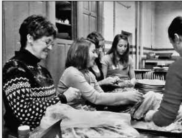
Volunteers prepared dinner for TWC's 2009 Participant Christmas Party. This year, volunteers donated 195.5 hours to this annual event!